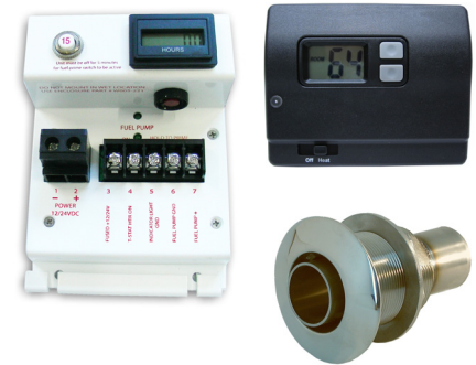
Figure: Example forced air heat Installation. See manual for installation guidelines.