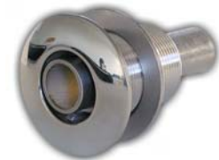
*Grilles also available in White or Gray